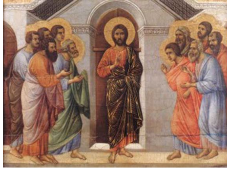
Jesus appears to his disciples John 20:19-31