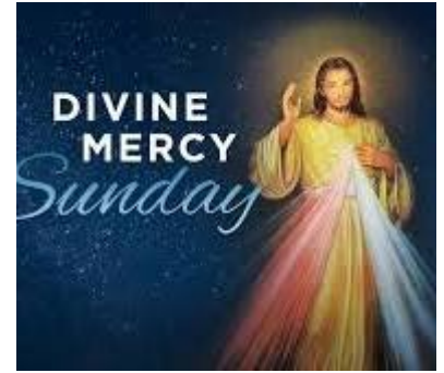
Cycle C 27 th April 2025